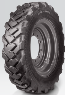
TIRE/WHEEL EXCHANGE PROGRAM

OTR Engineered Solutions (OTR) is a market-leading global enterprise specializing in off-the-road terrain engaging solutions for original equipment manufacturers (OEMs) and aftermarkets. OTR also provides value-added services such as warehousing, tire mounting, and sequencing. Core markets include Construction, Lawn & Garden, Powersports, Agriculture, Forestry, Mining, Material Handling, and Specialty Vehicles.