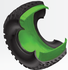
TyrLyner® SELF-SEALING TREATMENT

Available for Online Order at otrb2b.com