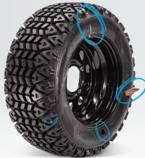
NDX™ AIRLESS TIRE TECHNOLOGY