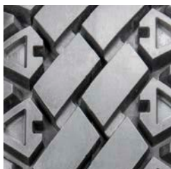
350 SUPER MAG