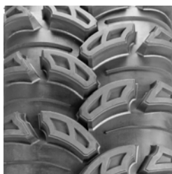
DIRT MASTER 10

All-terrain tires work for any off-road surface. Whether driving through mud, muck, water or sand, tires like the Wizzard, Trail Warrior and HP-009 keep you moving forward, safely and comfortably. These tires were designed for durability, stability, versatility and a smooth ride.