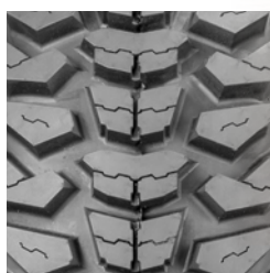
TRAIL WARRIOR 11