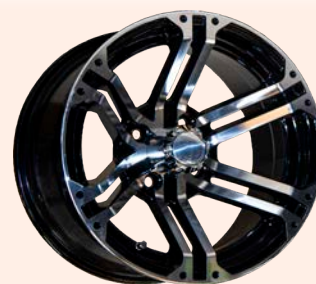
OTR custom 14" and 15" wheels for UTV applications--available for aftermarket use.