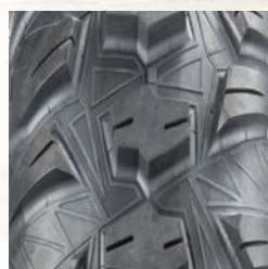
PRO TERRAIN 11