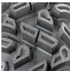
WIZZARD R2 11