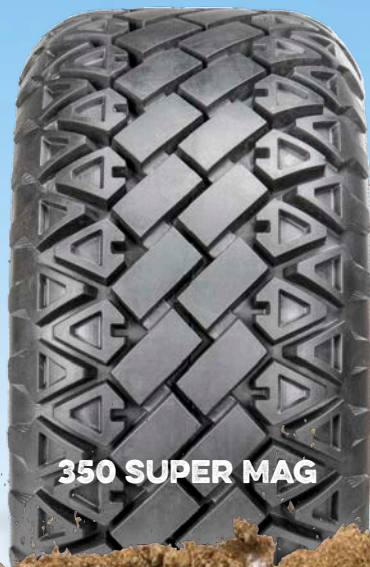
350 SUPER MAG